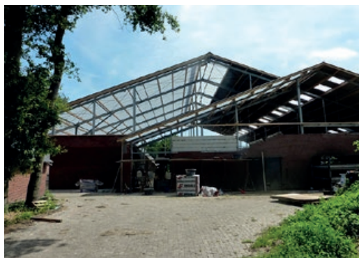
Half roof equipped with light sheets