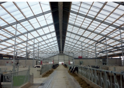
Entire roof equipped with light sheets