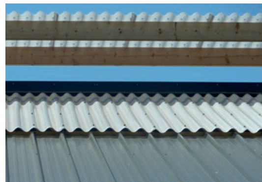
Application as skylight and vents

The Marlon CST HeatGuard sheets are produced with an aluminium pigment which is incorporated into the polycarbonate. The pigment ensures that the solar radiation heat is reflected. Depending on the desired light transmission and heat protection, the roof sheets are available in three models: HG25, HG50 and HG100.